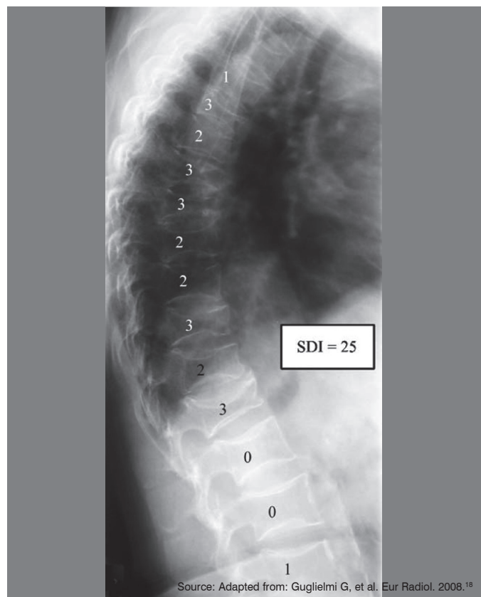
Figure 2. SDI calculation model in a spine x-ray.