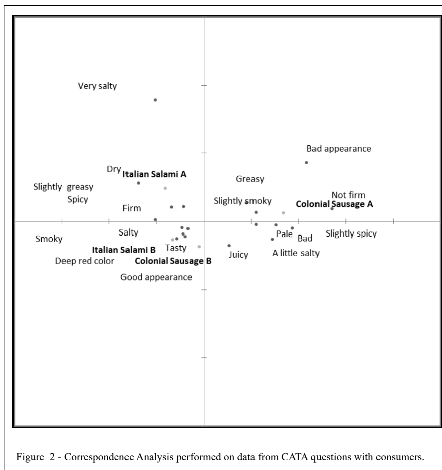
Figure 2 - Correspondence Analysis performed on data from CATA questions with consumers.

view point, the results of the application of ANOVA and the Tukey mean difference test for the physicochemical data revealed little difference between Italian Salami and Colonial Sausage, except for the moisture and b^* quality indicators, which were different only for Colonial Sausage A, suggesting greater standardization of Italian Salami. When evaluating the sensory descriptions of fermented sausages performed on data from CATA questions by one-dimensional aspects, the differences between the samples became much more evident. The description of fermented sausages by consumers using the CATA technique not only allowed detecting sensory differences between Italian Salami and Colonial Sausage, but also allowed verifying a sensory pattern only for Italian Salami. In addition, the use of the technique highlighted the discriminatory ability of consumers for these often confused fermented sausages (BERTOL et al., 2012).