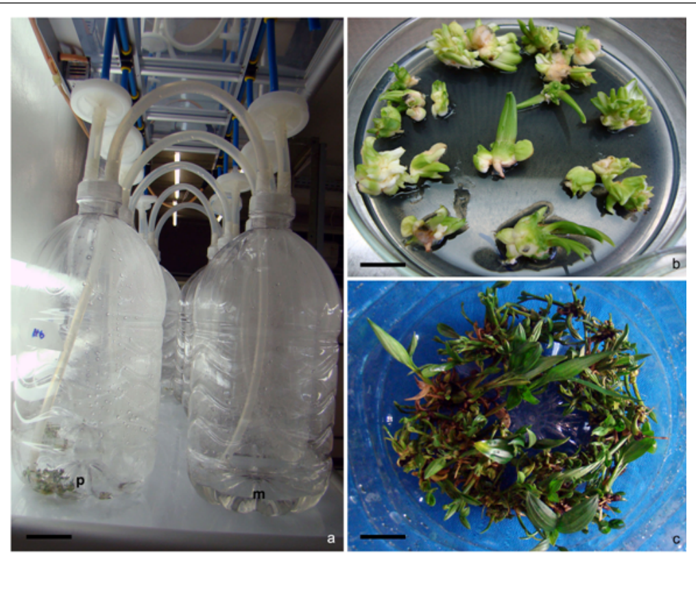
Figure 1 - Temporary immersion system culture of Bactris gasipaes Kunth. (a): Twin flasks. Bar=44 mm. (b): Plantlets converted from somatic embryos, used as initial explants. Bar= 5.2 mm. (c): After 12 weeks of culture in a temporary immersion system in MS medium. Bar= 33 mm. p= plantlets; m= culture medium.

0.15 g were weighed and quantification done in an Elemental Analyzer (Vario EL III).