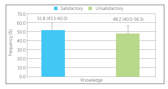
Figure 2 - Teachers distribution [prevalence (CI 95%)] according to level of knowledge about dental trauma and emergency protocols.

Table 3 - Association between the level of unsatisfactory knowledge about dental trauma/emergency protocols and characteristics of the studied sample.