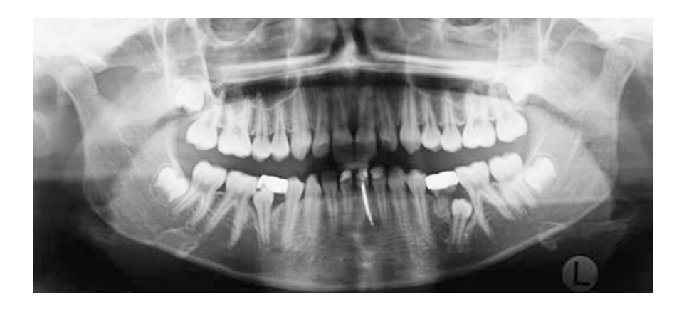
Figure 1 - Pretreatment (T_1) panoramic radiograph.