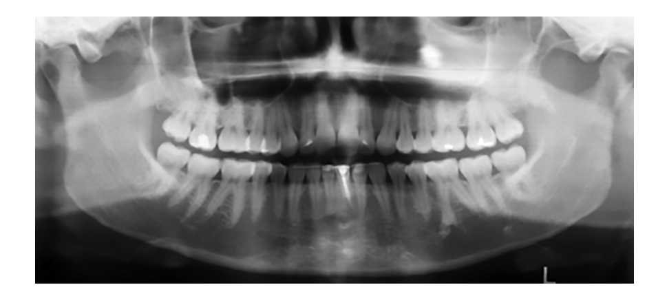
Figure 3 - Long-term post-treatment ( T_3 ) panoramic radiograph.

third molars. At T_2 , only one patient had extraction of third molars. Finally, at T_3 , only four additional patients had third molars extracted.