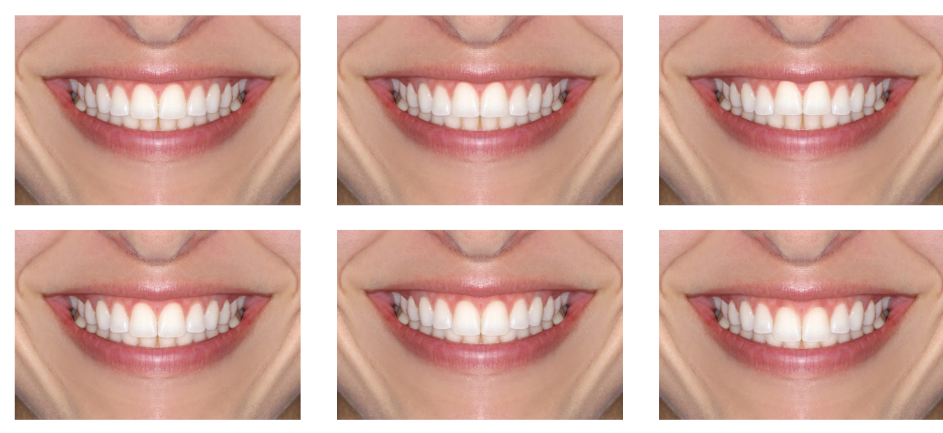
Figure 3 - White woman close-up smile view in 0.5-mm altered vertical positions increments.