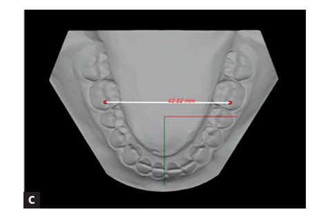
Figure 4 - Digital model evaluation, as follows: A) arch length, B) intercanine and C) intermolar widths.