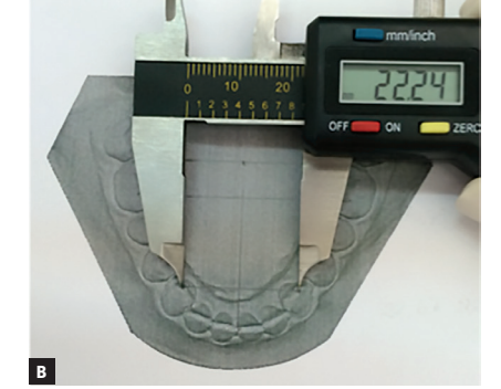
Figure 5 - Printed image evaluation, as follows: A) arch length, B) intercanine and C) intermolar widths.