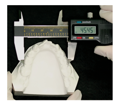
Figure 3 - Plaster model intermolar width evaluation.