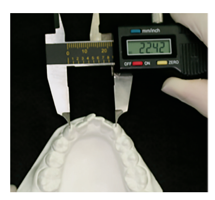
Figure 2 - Plaster model intercanine width evaluation.