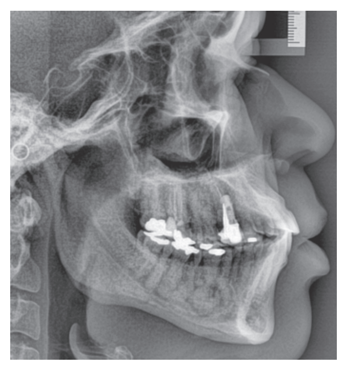
Figure 4 - Other radiographic findings of same clinical case with florid cemento-osseous dysplasia seen for evaluation of possible orthodontic treatment. Mandibular lesions are mixed and overlap roots of molar teeth, as they are randomly distributed in posterior region; cotton-wool appearance.

Surgical procedures of any nature should be avoided, including those for orthodontic treatments, such as traction and the placement of mini-implants and mini-plaques.