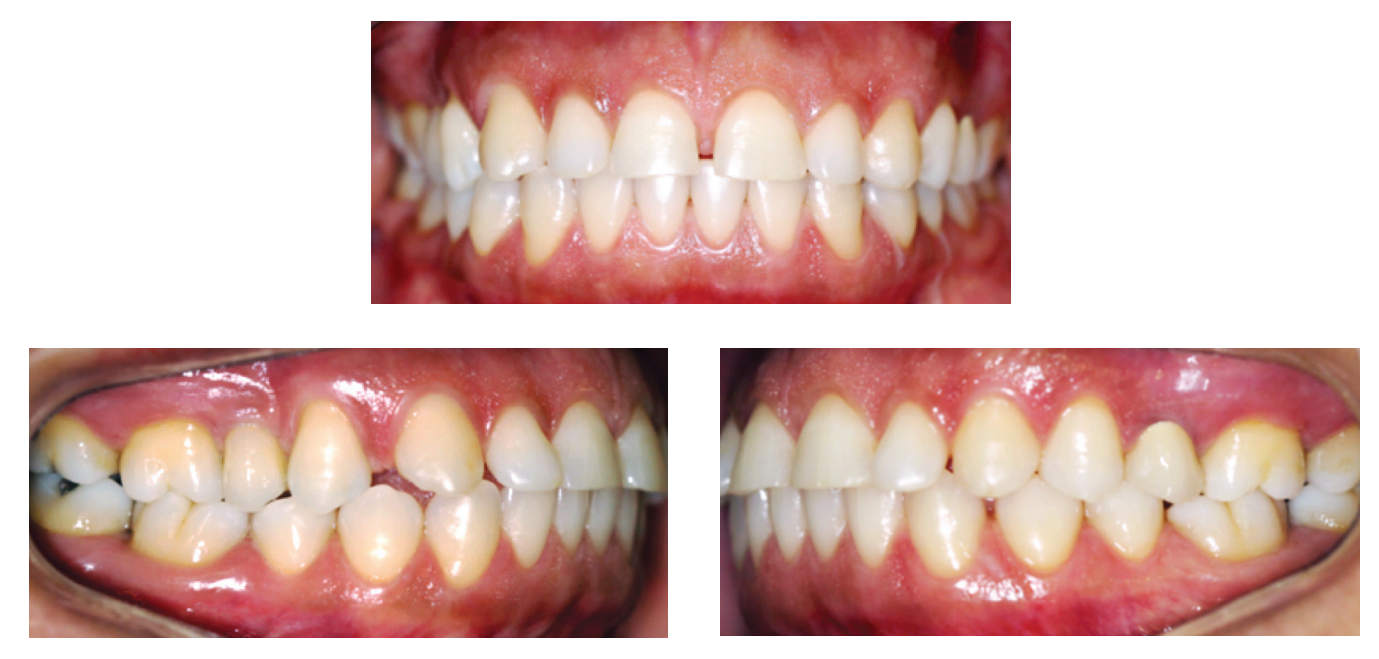
Figure 1 - Case of florid cemento-osseous dysplasia, seen for evaluation of possible orthodontic treatment. Black woman aged 45 years and 3 months. No symptoms associated with lesion and no systemic diseases reported. Frontal and lateral views.

leads to initial acute inflammation, but rapidly goes into a mild or moderate chronic phase, in which there is restricted accumulation of mediators at the site of inflammation.