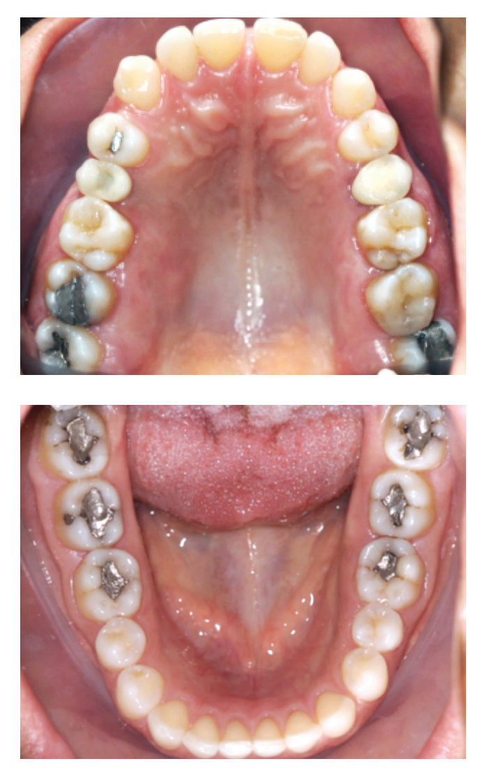
Figure 2 - Same case of florid cemento-osseous dysplasia as in Figure 1, seen for evaluation of possible orthodontic treatment; occlusal view. No clinical signs of disease.

and d) death of osteocytes, cells that have a fundamental role in bone histophysiology.