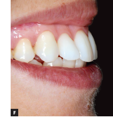
Figure 1 - Pre-surgical photographs (A and B); Trans-surgical photographs, showing before (C) and after (D) fixation of bone cement graft on subnasal depression, associated with periodontal plastic surgery; Post-surgical outcomes (E and F).