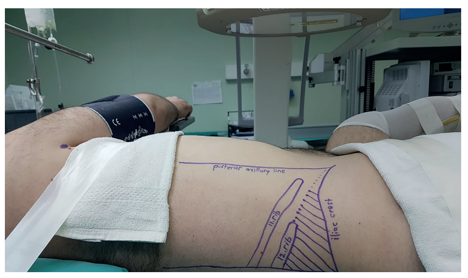
Figure 1 - Galdakao-Modified Valdivia position in supine m-PNL. The shaded area between lower rib, posterior axillary line and iliac crest shows the subcostal access location.

After the induction of general anesthesia, a 5Fr Ureteral catheter was placed and fixed on the Foley catheter in the lithotomy position. The patient was then repositioned in the prone position. Skin surface was marked to indicate the lower rib margin, posterior axillary line and iliac crest (Figure-2). Percutaneous access was achieved under C arm fluoroscopy guidance. The puncture was performed with an 18 gauge percutaneous access needle. Following successful puncture, a 0.035 inch guidewire was advanced through the needle into the PCS or ureter. At later stages, tract dilatation, nephroscopy, stone fragmentation, and stone retrieval were performed in a manner similar to supin m-PNL. All supine and prone procedures were performed by two experienced urologists at the tertiary referral center.