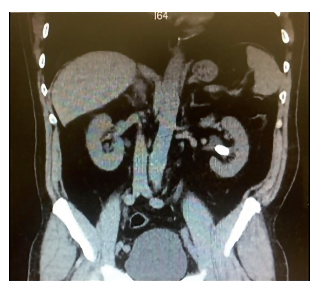
Figure 1 – Nephrolitiasis.

comes symptomatic (9). Nephrolithiasis has been referred as the first sign for the diagnosis of sarcoidosis in some patients (11-17). In studies with a careful review of patient's medical history, renal colic was the first sign of the disease in 2.2% of cases (10). However, the diagnosis was done in only half of the patients by the time of the renal calculi diagnosis. The other half of patients had their diagnosis only when other symptoms of chronic sarcoidosis became clinically significant. In these studies, most patients with nephrolithiasis had pulmonary involvement on chest x-ray and the majority also had palpable lymphadenopathy or cutaneous lesions. This combination of findings should alarm the urologist and patients presenting with calcium-based kidney stones that otherwise would be in a low-risk group for nephrolithiasis, such as African American females, who should undergo a lymphadenopathy and skin physical examination and chest x-ray for signs of sarcoidosis.