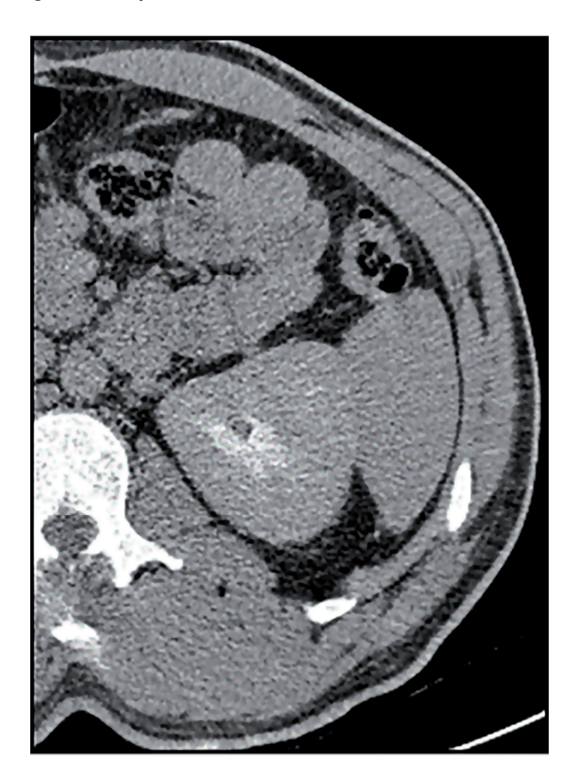
Figure 2 – Nephrocalcinosis.

are rare thought when present may simulate kidney neoplasia (2).