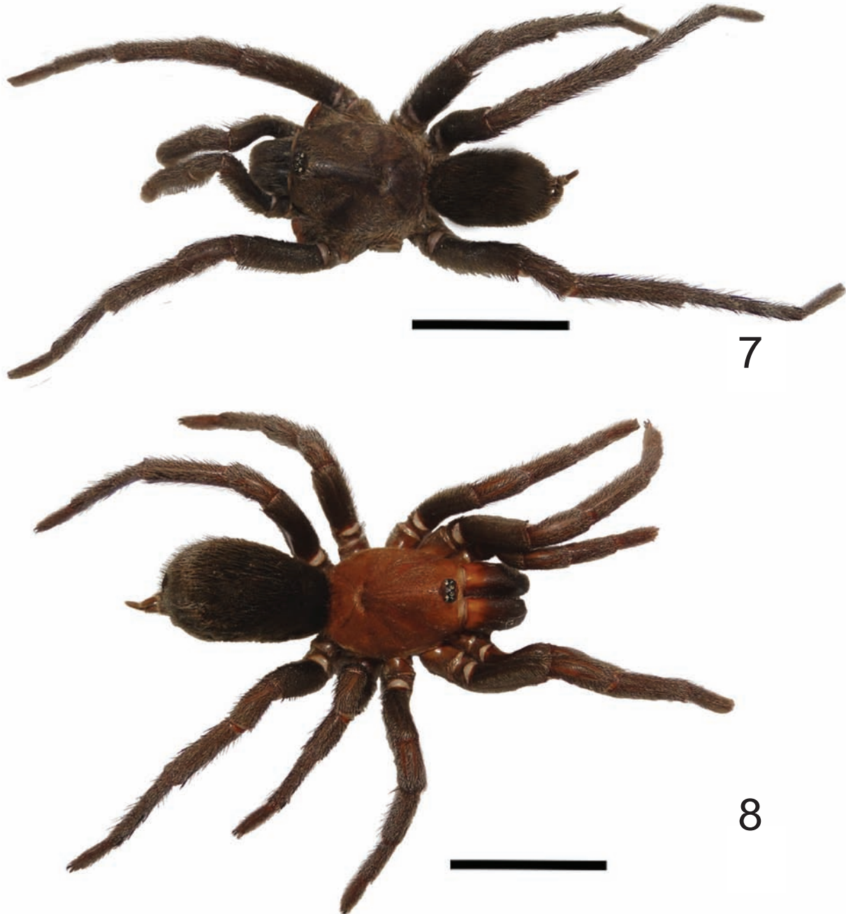
Figs 7-8. Tmesiphantes aridai sp. nov., habitus, dorsal view: 7, male holotype; 8, female paratype (IBSP165019). Scale bars: 1 cm.

Diagnosis. Males of Tmesiphantes aridai sp. nov. resemble T. perp (see GUADANUCCI & SILVA, 2012, figs 11-13) and T. nubilus (see YAMAMOTO et al. , 2007, figs 3-5) by the morphology of the palpal bulb, but can be distinguished from T. perp by the palpal bulb with an inconspicuous tegular basal projection, but presenting a very slender embolus with shorter keels not extending to the tip (Figs