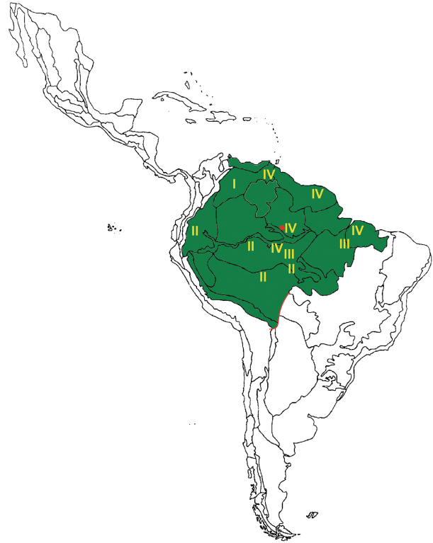
Fig. 2: approximate province biogeography of Rhodnius robustus genotypes [defined after Monteiro et al. (2003) and Pavan & Monteiro (2007)]. A red dot in the central Amazon indicates the collection site of the new R. robustus genotype (a member of the R. robustus I - R. prolixus clade) cited in the text. Biogeographical provinces as in Fig. 1 and Table I.

The apparent ecological specialisation of some Rhodnius and Psammolestes species may have also played a role in the diversification of the tribe. Thus, R. brethesi seems to be tightly associated with Leopoldinia piassaba palms, and it has been suggested that the distribution of R. stali closely matches that of Attalea