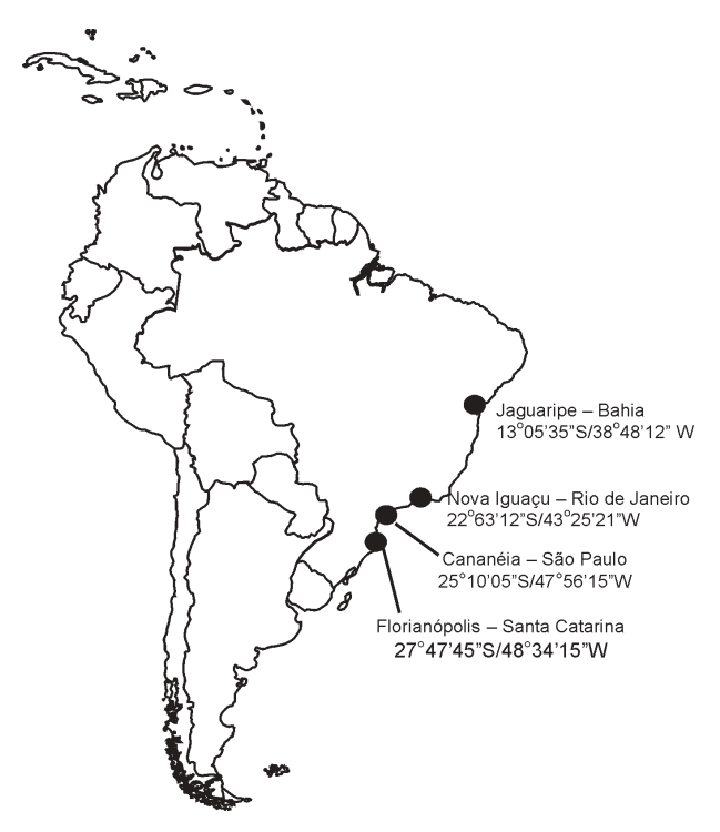
Fig. 1: source of specimens of Anopheles cruzii used in isoenzyme analyses.

electrophoresis using 2 \mu l of the lysate for approximately 2 h at 4°C in appropriate buffers. Detection of each enzyme was carried out by overlaying the electrophoresis gel with a solution of 10% agarose supplemented with specific substrates, co-enzymes and co-factors (for more details see Rosa-Freitas et al. 1992). After development in darkness for 20-60 min at room temperature, the enzymatic reactions were stopped by adding of 5% acetic acid. The gels were dried at room temperature and the analysis genotypic frequencies performed using the BYOSIS software (Swofford & Selander 1981).