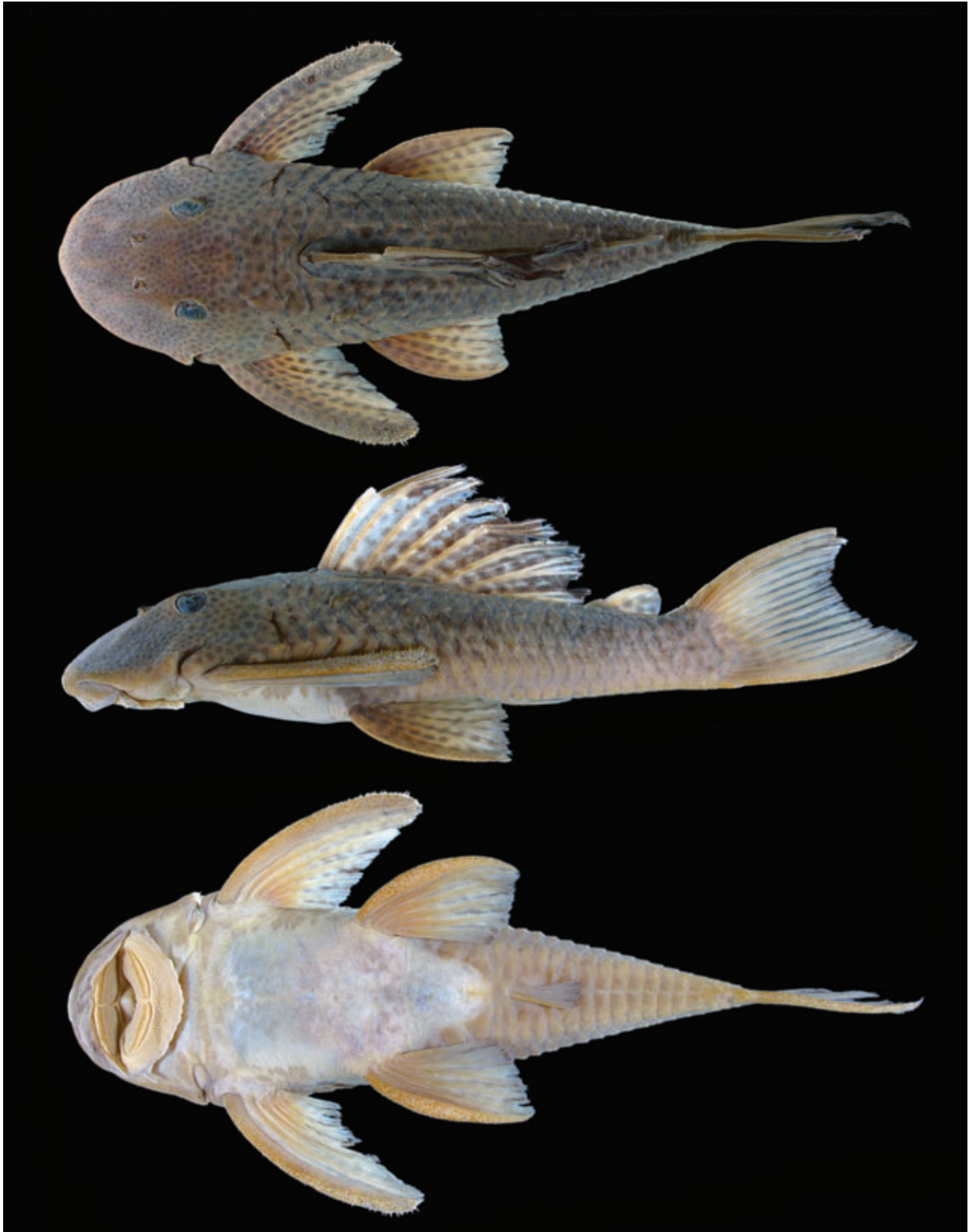
Fig. 1. Hypostomus kuarup , holotype, MZUSP 109765, 157.0 mm SL: Brazil, Mato Grosso, Campinápolis, rio Culuene.

interorbital region, straight from that point to dorsal-fin origin; sloped downward from dorsal-fin origin to region of dorsal procurrent caudal fin rays, then elevating again to caudal-fin insertion. Caudal peduncle somewhat rectangular in cross-