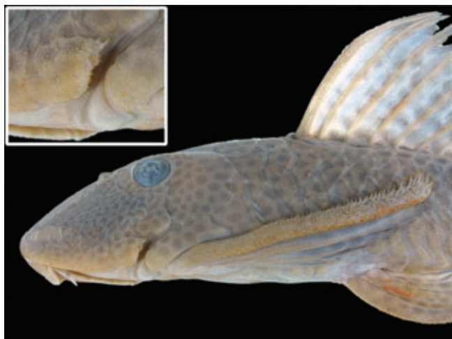
Fig. 2. Head and anterior portion of body in lateral view of Hypostomus kuarup , MZUSP 94864, 147.0 mm SL. Inset box on upper left corner show detail of odontodes development on cheek plates.

section, dorsally and ventrally flattened. Eye of moderate size (13.2-17.1% of HL), dorsolaterally positioned. Interorbital space slightly concave in transversal section view due to supraorbital arching. Mesethmoid forming inconspicuous median ridge on snout. Low ridge on dorsal surface of head, from nares to upper margins of eyes, and from latter to compound pterotic. Cheek plates with usually small odontodes; some specimens with moderately-sized odontodes (Fig. 2). Parieto-supraoccipital generally flat or with inconspicuous median ridge; with small blunt posterior process bordered by large, symmetrically paired predorsal plates. Dorsal and lateral surface of head and body covered with dermal plates except for small naked patch on tip