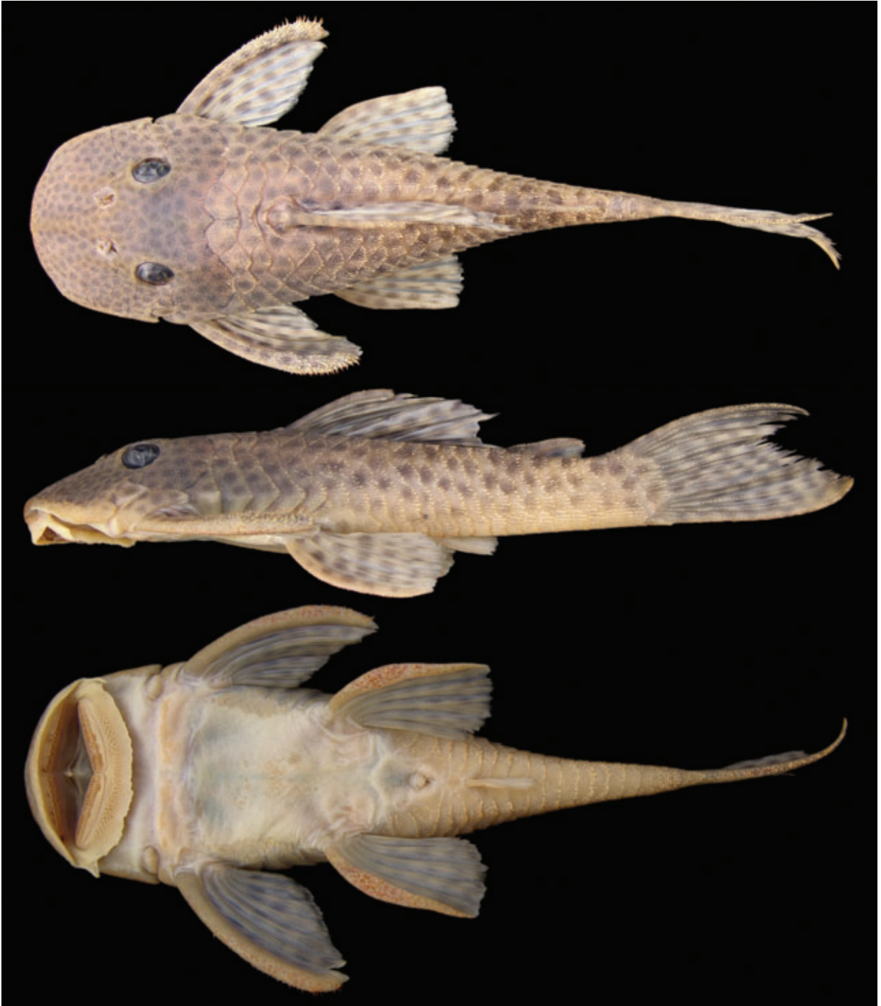
Fig. 7. Hypostomus mutuae , NUP 6641, 109.2 mm SL: Brazil, Mato Grosso, rio Paraguay basin, rio Claro.

snout (Fig. 7). Molecular (P. Holanda-Carvalho, pers. comm.) and cytogenetic (L. Giuliano-Caetano, pers. comm.) evidence shows Hypostomus mutuae to be related to an assemblage of Hypostomus from the rio Paraguay basin that includes H. latirostris and H. ternetzi . Although the relationships of Hypostomus kuarup are at the moment unknown, we suspect that the species might be related to several undescribed