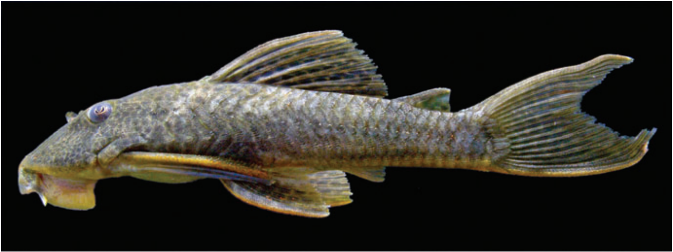
Fig. 4. Hypostomus kuarup , MZUSP 94864, 110.0 mm SL, photographed alive.

fin unbranched ray curved inward; when adpressed just reaching anal-fin insertion; its border almost straight. Anal fin i,4; when adpressed distal tip of posterior rays reaching fourth or fifth plate posterior to its origin. Caudal fin i,7+7,i; emarginate, with ventral lobe similar in length to slightly longer than dorsal lobe.