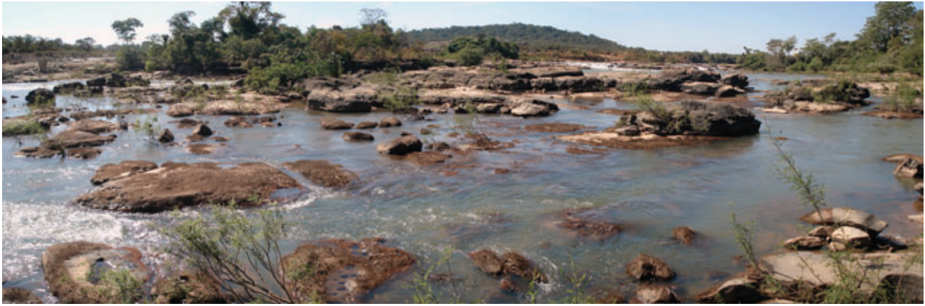
Fig. 6. Type locality of Hypostomus kuarup , Brazil, Mato Grosso, rapids at rio Culuene (currently dry by the diversion of the river channel due to the construction of the Paranatinga II hydroelectric dam). Photo taken during the early dry season.

current area of reservoir Paranatinga II (13°51'03"S 53°15'31"W), and tributaries of rio Culuene nearby. As the number of specimens is too large, a sample of 60 specimens from the aforementioned locality was chosen to constitute the type series.