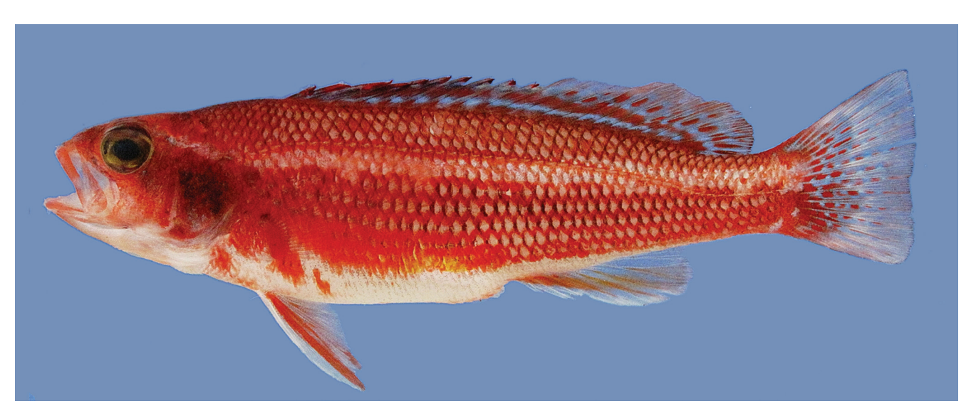
Fig. 1. Serranus aliceae, holotype, Brazil, Rio de Janeiro, Arraial do Cabo, Ilha de Cabo Frio, Saco dos Ingleses, MNRJ 38911, 67.1 mm SL, just after collection.