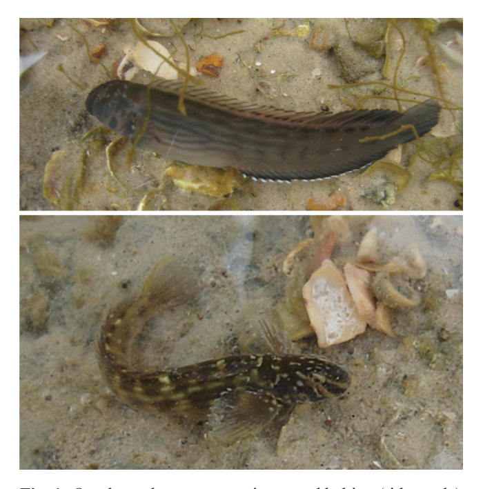
Fig. 1. Omobranchus punctatus in natural habitat (tide pools) in Brazil.

from the Caribbean entrance of the Panama Chanel. Fish collections made between 1935 and 1937 at the Pacific side of the Chanel (Miraflores locks) by Hildebrand (1939) yielded no specimens of O. punctatus. Also, the species was not recorded in these areas by McCosker & Dawson (1975). To date, there is no evidence of its occurrence on the Pacific coast of Panama. The Chanel first began operation in 1914. The first record of O. punctatus in Trinidad dates from the 1930s. The first records of O. punctatus in Panama, at the Caribbean entrance to the canal, are from 1967, much later than the first record from Trinidad (1930) (Table 1). Springer & Gomon (1975) and Carlton (1985) suggested that it is likely that specimens of muzzled blenny from Panama originate via shipping movements from the population at Trinidad. This hypothesis was supported by strong similarities in the morphology of specimens collected from those two countries.