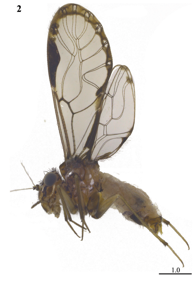
Figure 2. Euplocania quinquedivisa. Female. Scale in mm.

Euplocania quinquedivisa is unique among the 47 known species of Euplocania, having a distinct slender, pigmented marginal band in the forewing, from pterostigma to A<sub>2</sub>, with two almost triangular hyaline areas from R<sub>2+3</sub> to Cup, on each side of the vein ends at wing margin. Other Euplocania species have these hyaline areas in the pigmented marginal band (mentioned above), but in elliptical (E. andinoamazonica García Aldrete, Carrejo & Panche; E. vallecaucana González, García Aldrete & Carrejo; E. darwini Carrejo, García Aldrete & González; E. enderleini García Aldrete, Panche & González; E. gallegoi González, García Aldrete & Carrejo; E. mockfordi González, Carrejo & García Aldrete; E. pati-