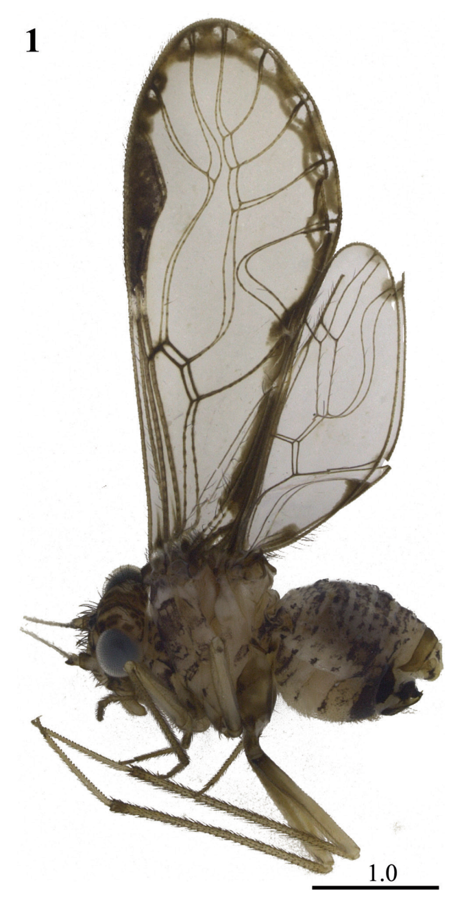
Figure 1. Euplocania quinquedivisa. Male. Scale in mm.

Material examined: 1 male (INPA). BRAZIL. Amazonas. Reserva ZF2, km 14, Torre. 02°35′21″S, 60°06′55″W. 14.vi.-03.vii.2018. Malaise trap, 16 m at the tower. Collection bottle in the west position. J.A. Rafael. 1 female (INPA). Same data as the male, except 19. ix.-03.x. 2017. Malaise trap, 8 m at the tower.