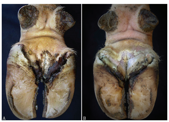
Fig.2. Topical treatment of bovine digital dermatitis with crude extract of Copaifera reticulata (copaiba oil). Bovine 21 referred in Table 4. (A) chronic bovine digital dermatitis (M4) on the day 0; (B) bovine digital dermatitis when the bandage are removed, covered with a whitish to pale yellowish crusty material, day 7.

* Treatment accompanied by only 21 days, as the animal died on the property of unclear cause, ** NT = non treated.