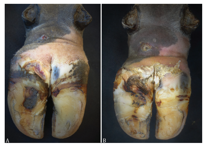
Fig.3. Topical treatment of bovine digital dermatitis with a salicylic acid paste (Novaderma®). Bovine 7 referred in Table 4. (A) Digital dermatitis in the first stage of ulcer (M2) on the day 0; (B) Bovine digital dermatitis is shown when bandage are removed, without an ulceration area and covered with a whitish to pale yellowish crusty material, day 7.

The low prevalence of BDD in cows destined for dairy production, in the Amazon biome, observed in this study