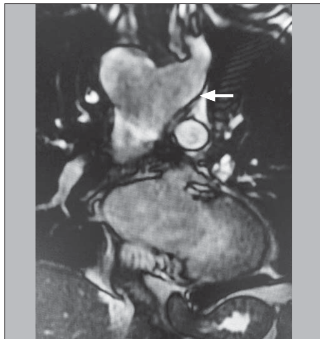
Figure 2. Coronal T2-weighted spin-echo magnetic resonance imaging showing Kommerell's diverticulum (arrow).