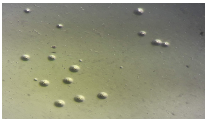
Figure 2 – Mycoplasma spp. from Cairina moschata traqueal swabs on solid modified Frey medium. Visualization under stereomicroscope (100X).

The presence of mycoplasmas in asymptomatic wild captive birds has already been reported in the study by Silva et al. (2016) who observed a prevalence of 16.5% Mycoplasma spp. in 85 parrots and Carvalho et al. (2017) who found percentages of 21.6%, 15.7% and 6.7% positivity in birds from, respectively, a Wild Animal Sorting Center, a commercial breeding site and a conservation breeding site and these results agree with what was found in our study. The presence of these free-living ducks close to captive birds in the zoo can pose a risk to health of susceptible birds and to species in recovery programs, since there is a possibility that Muscovy ducks are acting as reservoir of pathogenic mycoplasmas.