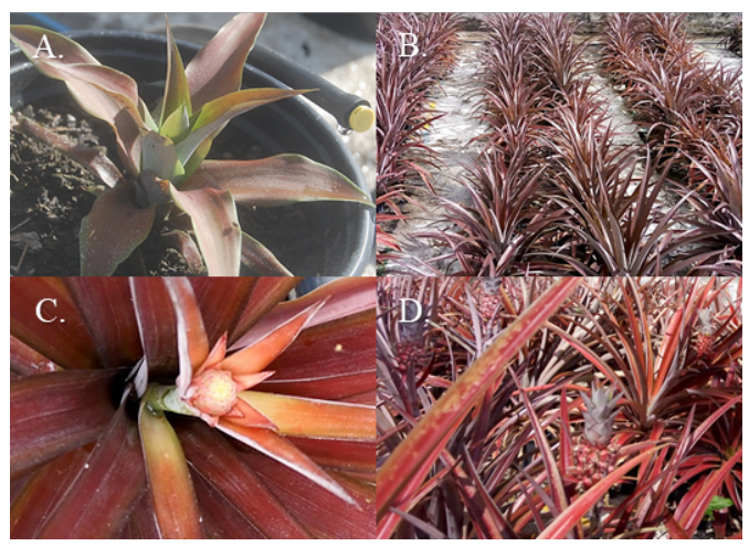
Figure 2. Transplanting (A), growth leaf (B), beginning of flowering (C), and formation of infructescence (D) of ornamental pineapple plants grown in pots under an anti-aphid screen

After formation of infructescence (May 21, 2016), the following variables were evaluated: number of leaves; 'D' leaf length and width (cm); shoot apex diameter (cm); plant