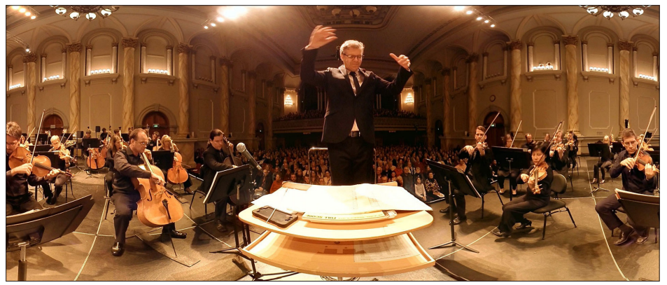
Image 5 – Screenshot from The Classics Unwrapped Virtual Reality Concert Series (2015); Artists: The Adelaide Symphony Orchestra and Jumpgate VR.

CAVE technology presents another medium for performance practitioners to explore virtual presence possibilities. In his article,