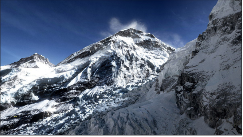
Image 2 - Screenshot from Everest (2016); Artists: Sólfar Studios and RVX.