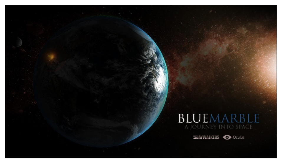
Image 3 – Screenshot from Blue Marble (2013); Artist: Jaywalkers Interactive.