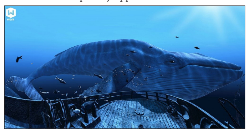
Image 1 – Screenshot from the Blu: The Encounter (2015); Artist: WEVR.

Mount Everest. The user must make their way over a couple ladders by walking and using handheld controllers. Those who have tried the demo have reported not only belief in the visual environment, but also felt as if they were physically climbing, cold, and afraid when looking down. Both demo programs attempt to transport the user from their literal present - wearing the HMD in a small cubic space - to the literal present of a vast natural environment. The realism of the computer content in the demo takes the user beyond the immersion of simply being surrounded by a series of images (as one might set up using Google Maps, for instance), reaching a point where the user is psychologically affected. It is noteworthy that primarily visual content can so profoundly affect one's sense of literal presence. As programs become increasingly complex, however, additional contributing aspects will likely need to be considered. The multiplicity of factors to account for and the ambitious aims of VR technology - to simulate reality (or a fictional reality) - will likely necessitate an interdisciplinary approach.