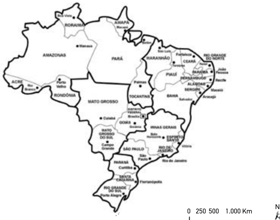
Figure 1. States and cities where respondent-driven sampling (RDS) among men who have sex with men (MSM) was conducted in 2016, Brazil.

Before initiation of the BBSS we conducted formative research (FR) as recommended 28 using both individual interviews and Focus Group Discussions (FGD) 29 . The individual and FGD interview guides covered sexual identities, social and geographic organization of MSM in each city and perceived community acceptance, including violence, homophobia and stigma. Questions related to study logistics such as the site of the study, hours