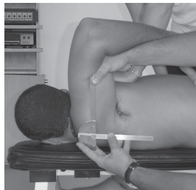
Fig. 3 – Final position

The experimental protocol followed the following stages: