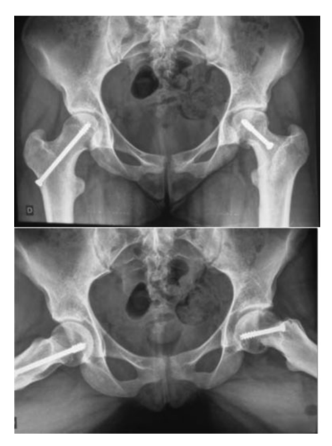
Fig. 4 Anteroposterior radiograph (above) and in Lauenstein profile (below) of the pelvis in the postoperative period showing the correction of the deformity.

The anamnesis, the physical examination, and the radiographs were compatible with cam-type FAI secondary to epiphysiolysis. Due to the symptomatic pain associated with joint blockage, the recommended treatment was osteochondroplasty via arthroscopy.