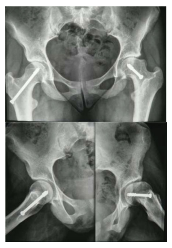
Fig. 1 Anteroposterior radiographs of the pelvis (above) and in Dunn profile of the hips (below) showing deformity in the anterolateral region of the left femoral neck compatible with cam-type impingement.

Upon physical examination, she had an important limitation of internal rotation of the left hip associated with pain during the maneuver. The Drennan sign was observed on the left during the examination. The patient had no neurovascular changes in the lower limbs. Preserved muscle strength was verified in both lower limbs.