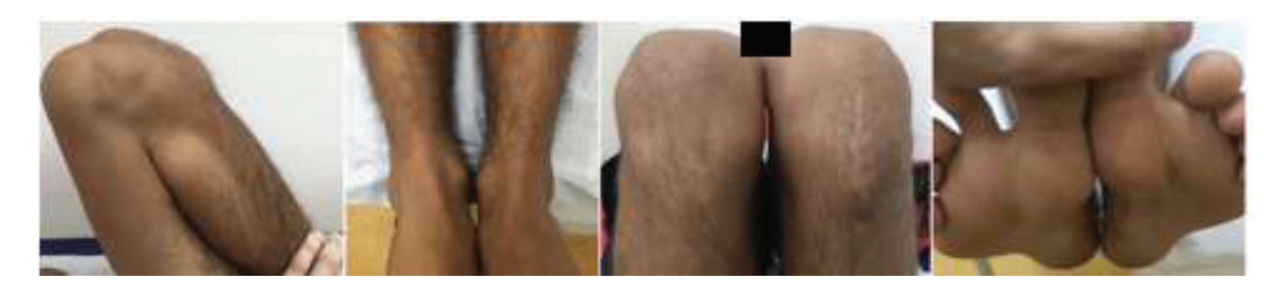
Fig. 4 Clinical images one year after surgery.