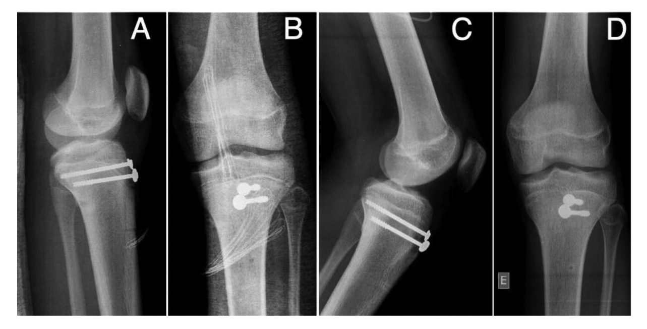
Fig. 2 Anteroposterior and lateral radiographs at the immediate postoperative period (A,B); anteroposterior and lateral radiographs three months after surgery (C,D).