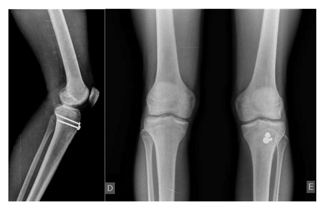
Fig. 3 Radiographs one year after surgery.