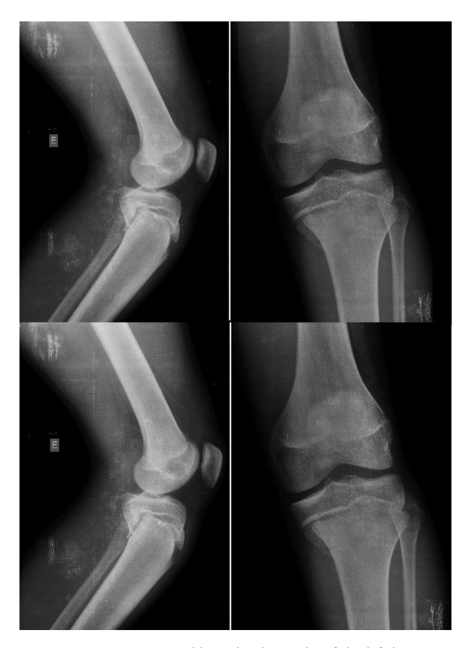
Fig. 1 Anteroposterior and lateral radiographs of the left knee showing avulsion fracture of the tibial tuberosity.

The physis, which is not as stiff as the remaining bone tissue, is an area of the immature skeleton highly susceptible to injury. Since excessive physical activity increases the physeal