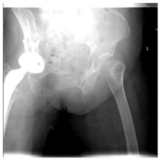
Fig. 1 Radiograph of the left hip at presentation showing femoral neck fracture.

were identified and coagulated. Abnormal appearing blood vessels were also present in this area. These vessels provided difficulty in achieving hemostasis, initially resulting in \sim 300 to 400 mL of blood loss during this process. Hemostasis was eventually achieved, and the remainder of the THA was performed uneventfully (>Fig. 2). During the procedure,