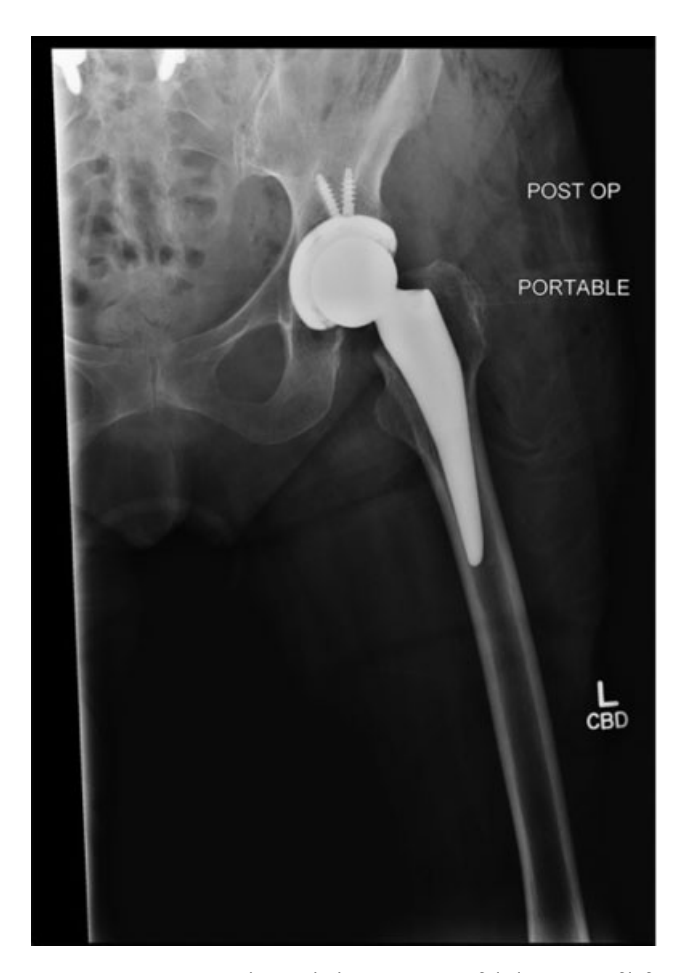
Fig. 2 Postoperative radiograph showing successful placement of left total hip arthroplasty.

the patient received one unit blood. The patient was stable immediately postoperatively.