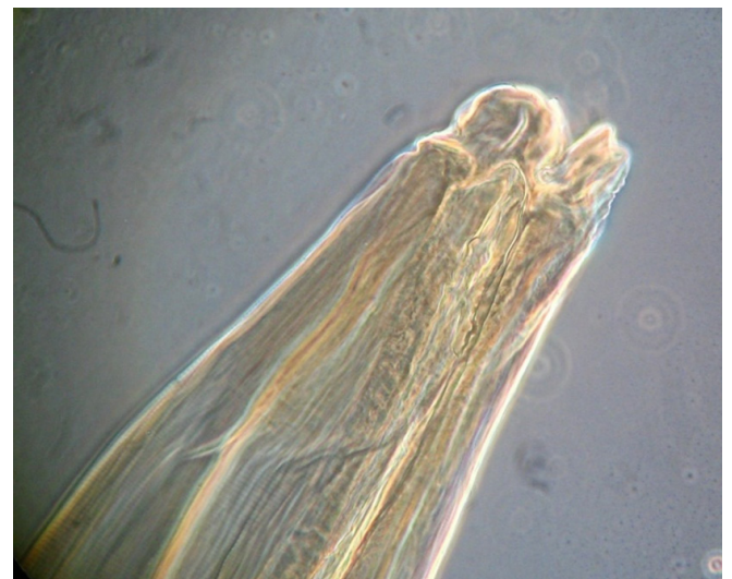
Figure 1. Anterior part of Ascaridia hermaphrodita .

The prevalence of helminths in birds of prey (22.2%) in this survey was lower than that found in Italy by Santoro et al. (2010), who, through necropsy, reported prevalence of 95% in free-living rapine birds. On the other hand, by fecal examination,