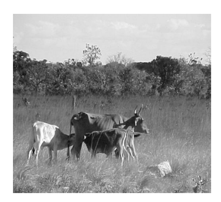
Figure 1 - Allo-suckling: Curraleira cow suckling her own calf, an orphan calf and a calf from the general herd.

A total of 571 cases of attempted suckling were observed, of which 87.1% (497) were successful. In 12.9% (74) of the cases suckling was attempted but not successful. Calf sex was not a significant factor ( X^2 = 0.57 ; P>0.45) in determining the success of suckling (Table 1). The position of the calf relative to the cow significantly affected ( X^2 = 129.67 ; P<0.0001) the success of suckling. When the calf nursed from the normal (lateral) position, suckling was successful 99.5% of the time. Attempts to suckle from behind were described in 136 cases, with 92 (67.6%) being successful. It is thought that as the calf trying to suckle from behind is out of sight, the dam does