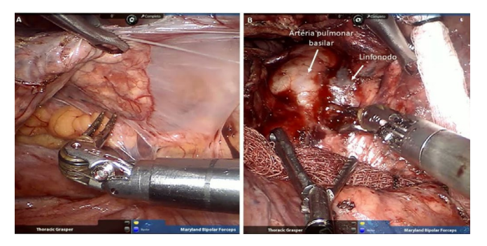
Figure 2. Intraoperative image of right upper bilobectomy to bronchiectasis secondary to Mycobacterium abscessus. In A, we observed the presence of pleuropulmonary adhesions with the chest wall and mediastinum. In B, the presence of an inflammatory lymph node attached to the basilar pulmonary artery is noted.

The operation is performed systematically to minimize pulmonary manipulation, as already described by Terra et al.<sup>9</sup>. As a technical detail, is cases of pleuropulmonary adhesions found during inspection of the pleural cavity after introduction of the optics, before docking of the robotic platform we chose to release the lung by thoracoscopy until the trocars' puncture sites for the robotic arms were free of adhesions. Figure 2 shows an intraoperative image of lung resection due to bronchiectasis.