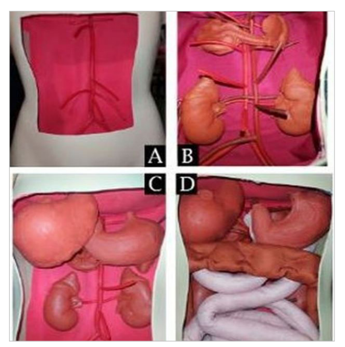
Figure 1. Attachment of structures to the simulator: blood vessels (A); retroperitoneal organs (B); liver and stomach (C); and intestines (D).

models. The organs of these models were isolated, immersed in negative plaster blocks for mold formation and, after drying and removing the original models, filled with silicone. The silicone models were then fixed in their anatomical position (Figure 1B). The peritoneal membrane was represented by a fine mesh of semitransparent fabric, isolating the peritoneal cavity from the retroperitoneum.