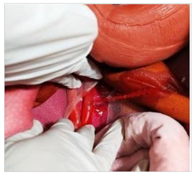
Figure 3. Focus of retroperitoneal bleeding.