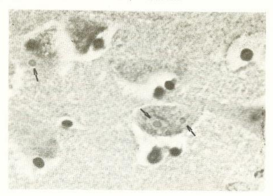
Fig. 1 - Negri bodies (arrows) in hippocampal neurons. HE, x 400

The brain weighed 1.574 g, was edematous and congested with flattened and broad convolutions in the right frontal side a perforating lesion was seen, due to trepanation for intracranial pressure control. The microscopical study showed a moderate degree of mononuclear inflammatory cells around vessels and necrotic or degenerating neurons, together with a few neutrophils. Many of these neurons had cytoplasmatic Negri bodies (Fig. 1), Such alterations were more intense in brain stem, basal ganglia and hypothalamus. The meninges were grossly whitish and the histopathological examination showed an intense neutrophilic inflammatory response, mainly around the trepanation area.