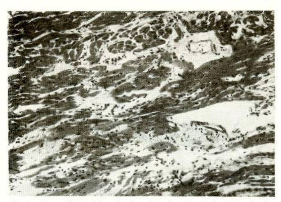
Fig. 2 — Myocardial interstitium with edema, hyperplasia of Anitschkov cell and a few mononuclear cells. HE, x 160