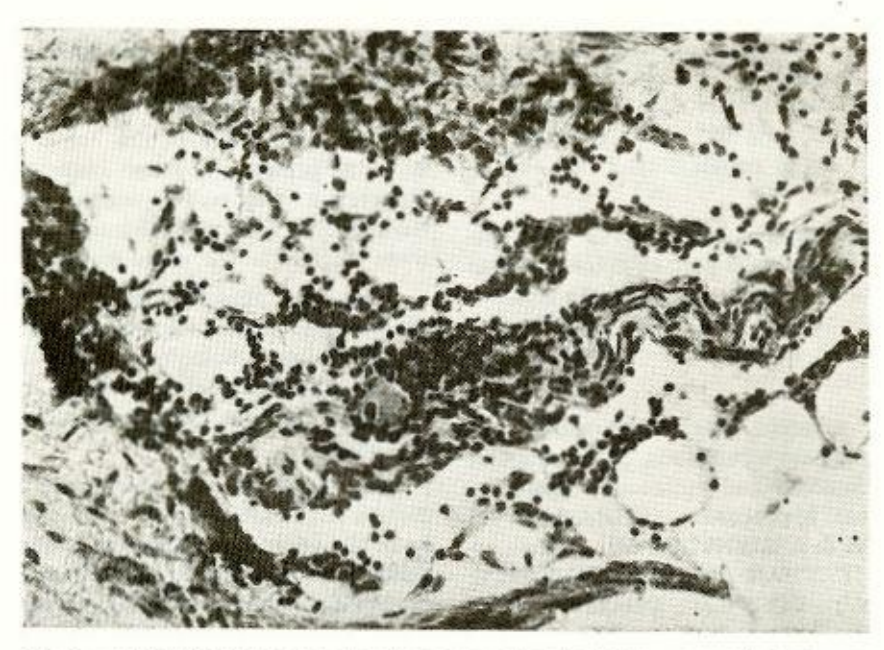
Fig. 3 — Mononuclear inflammatory cells in a small right atrial parasympathetic nervous branch. HE, x 160

rables in patients without previous heart diseases (ARAUJO et al. 1; CHEETHAN & HART3; ROSS & ARMENTROUT 5; ROUX et al. 9; WAR-RELL 11).