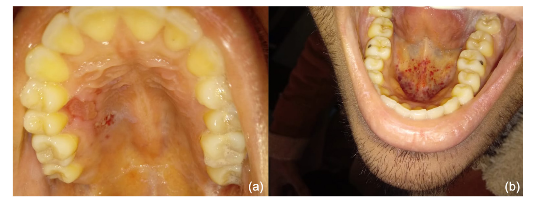
Figure 3 - Oral mucosa lesions of patient A: hard palate (a) and floor of mouth (b).

As a vulnerable group, surveillance for COVID-19 in HSCT recipients, from pre-hospitalization to the onset of signs of immunodepression and also of HCW directly