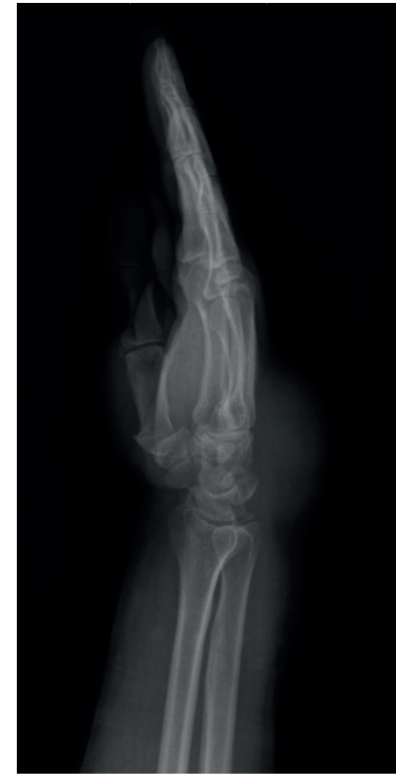
FIGURE 1: Radiological study revealing soft tissue swelling of the wrist.