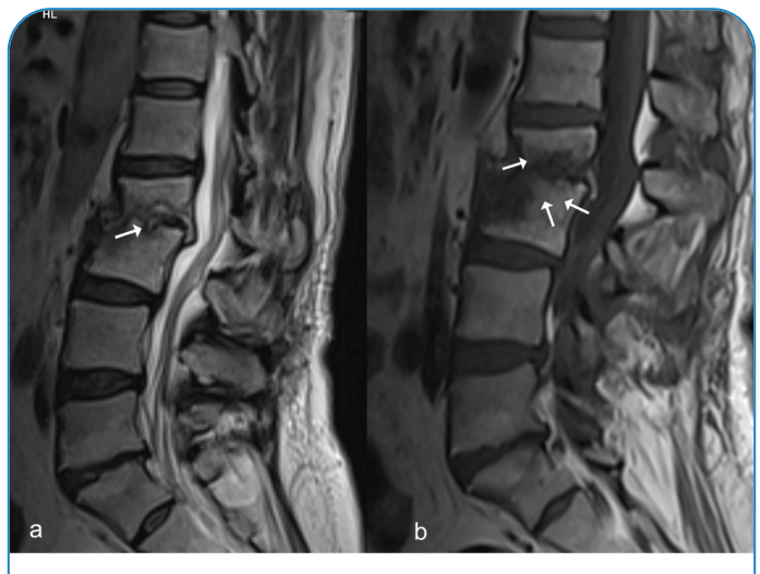
FIGURE 2: Posttreatment MRI scan. (a) The sagittal T2-weighted image without fat suppression shows persisting erosions in the vertebral endplates (arrow) but resolution of the hyperintense signals in the disc space and epidural area. (b) The sagittal T1-weighted image without fat suppression shows decreased signal losses (arrows) in the vertebral bodies and disc space.