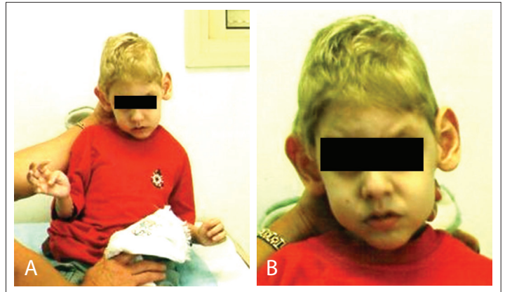
Figure 2. Appearance of the patient at five years of age showing microcephaly, prominent large ears, pointed chin (A and B), and spasticity of upper limbs (A).

in our patient of absence of immunoglobulin M (IgM)-specific antibodies for toxoplasmosis also help to rule out the possibility of diagnosing this congenital infection.