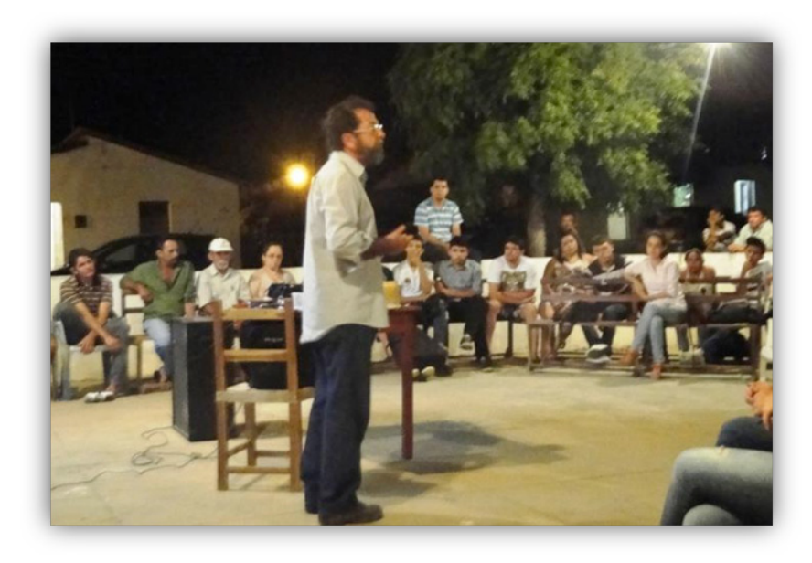
Figure 5 – Research geologist of the UFC in dialogue about the EIA with community of Riacho das Pedras, Santa Quitéria, 2014.