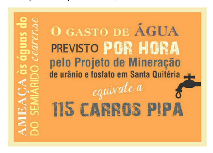
Figure 6 - THREAT to the waters of the semiarid region of Ceará: the expected hourly consumption of water of the uranium and phosphate mining project in Santa Quitéria is equivalent to 115 water distribution trucks<sup>11</sup>.

These materials were important examples of autonomous processes of knowledge construction about the project and materials used for training and debate with communities, institutions and social movements of the region, although the quantity and reach was much lower, in comparison to materials produced by the consortium.