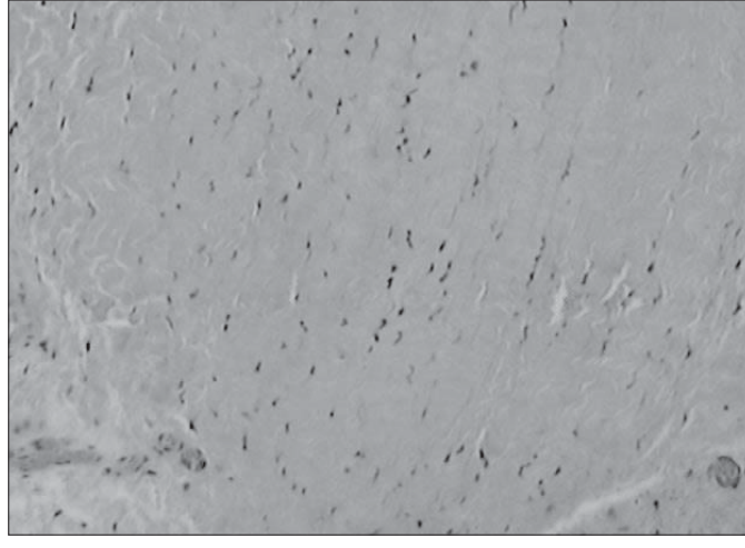
FIGURE 2. Fascia transversalis of a corpse (control) showing collagen in pink-redish color (H-E 400x)