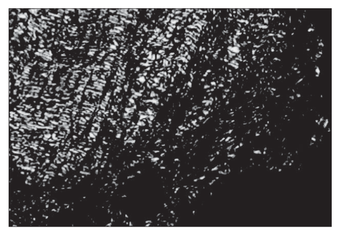
FIGURE 4. Fascia transversalis of a corpse (control) using Pricosirius coloring enhanced 400 times (400x)