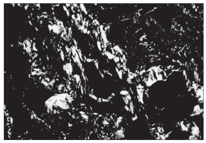
FIGURE 3. Fascia transversalis of a corpse (control) using Pricosirius coloring enhanced 400 times (400x).

type III was found in the patients, which showed a statistical meaningful difference (P = 0.0220) as seen in Figure 5.