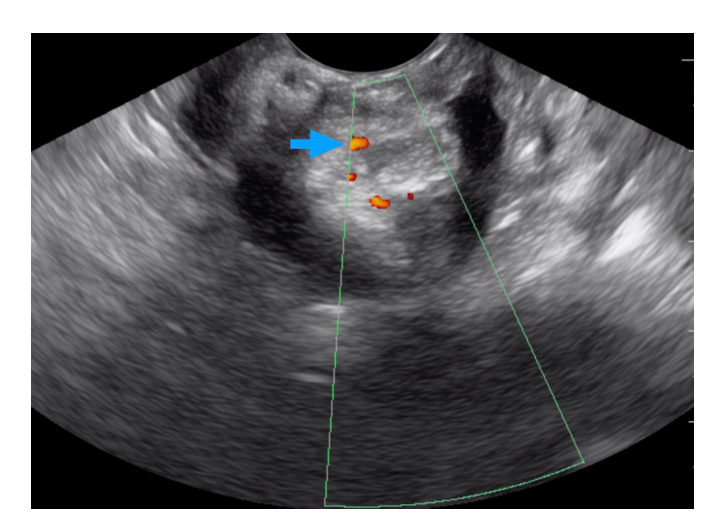
FIGURE 3. Endoscopic ultrasound imaging revealing a dilated main pancreatic duct and a doppler-positive vegetation (blue arrow).

histopathological diagnosis was high grade dysplasia and no invasive cancer. The patient was discharged 11 days after surgery. Six months later she was admitted to hospital for diarrhea and malnutrition which responded to nutritional therapy and pancreatic enzyme upscaling. She died a month later due to sepsis from unknown origin.