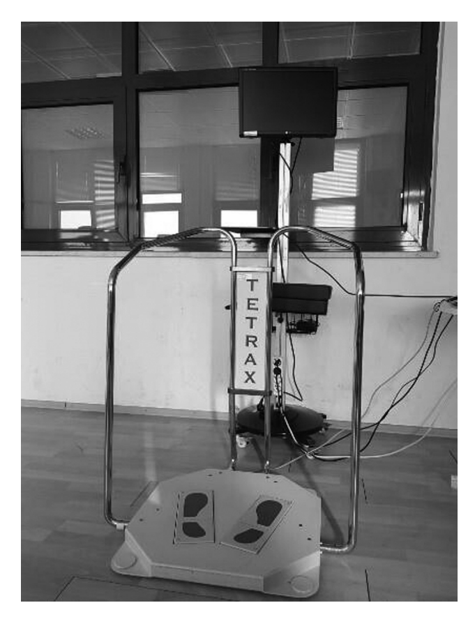
Figure 2 The Tetrax biofeedback system.

dorsiflexors) performed three days per week. The patients were supervised by an experienced physiotherapist to avoid falls.