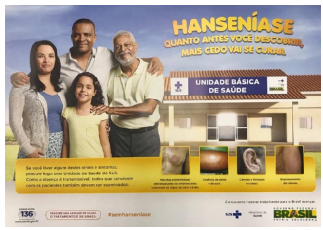
Figure 4 - Campaign from 2018 to 2020