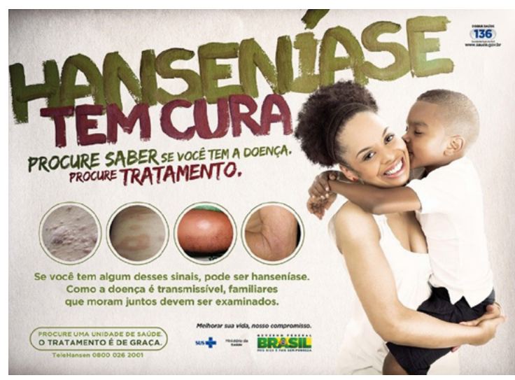
Figure 1B - Campaign 2014

Poster Translation: There is a cure for leprosy