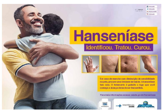
Figure 2B - Campaign 2015

Poster Translation: Leprosy