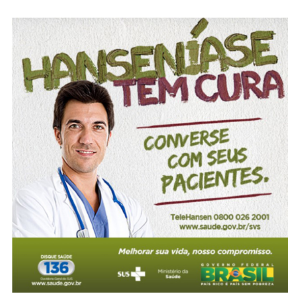
Figure 1A - Campaign 2014