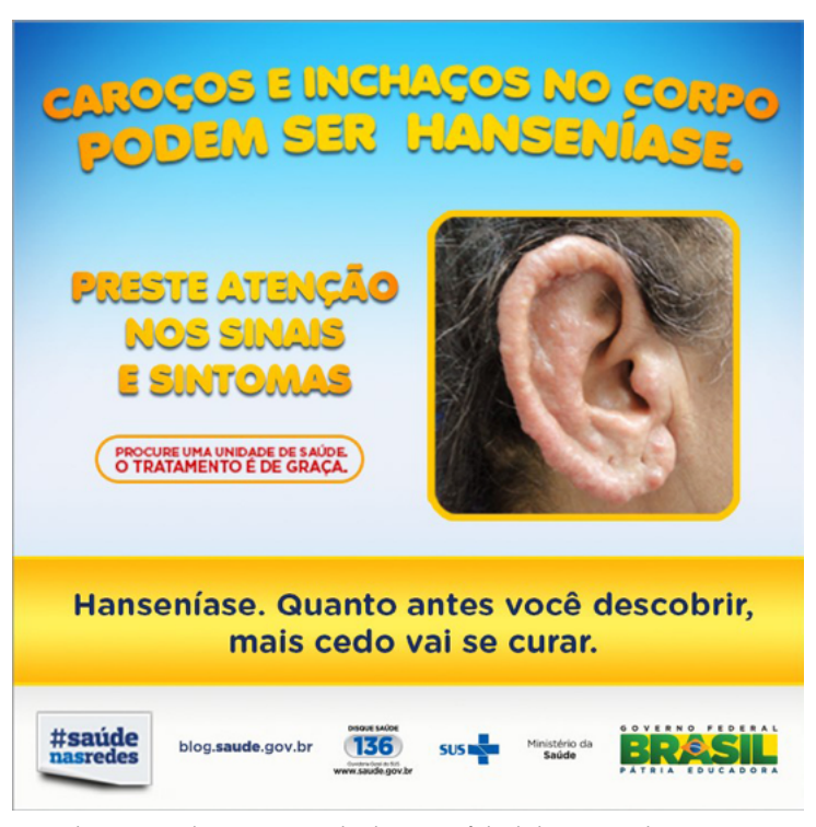
Figure 1C - Campaign 2014