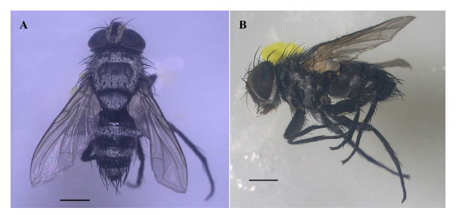
Figure 2. Male of Leptostylum oligothrix . A – dorsal view; B – lateral view. Scale bars = 1 mm. This figure is in color in the electronic version.