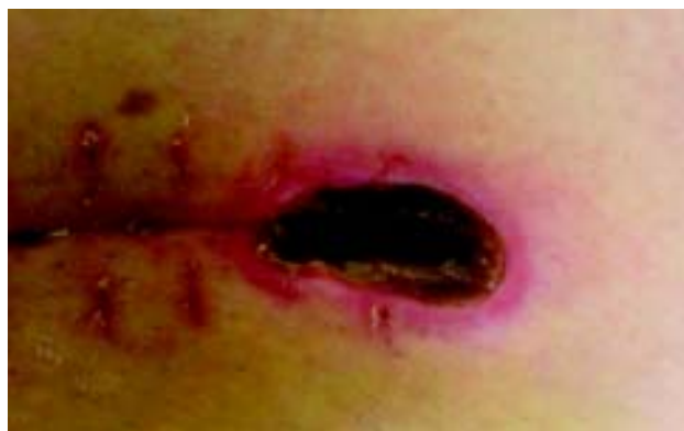
Figure 2 - Presence of macerated tissue

Dressings were changed daily and included the same conduct until November 28 th 2011, when mechanical debridement had to be repeated due to the macerated area (Figure 2).