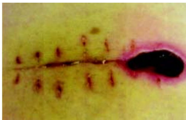
Figure 3 - Slow chemical debridement

On November 29 th 2008, the collagenase coverage was replaced by calcium alginate due to the former's lack of efficiency. On November 30 th 2008, the efficiency of the new coverage was perceived, when a large part of the necrosis was removed (Figure 3).