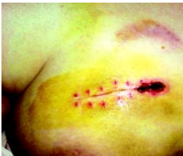
Figure 1 - Tissue necrosis

The first measure, taken already on November 24 th 2008, was the mechanical debridement of the largest possible part of necrotic tissue (Figure 1). The wound still had a region with adhering necrotic tissue. The only coverage the institution had at its disposal was used: collagenesis, in order to start chemical debridement.