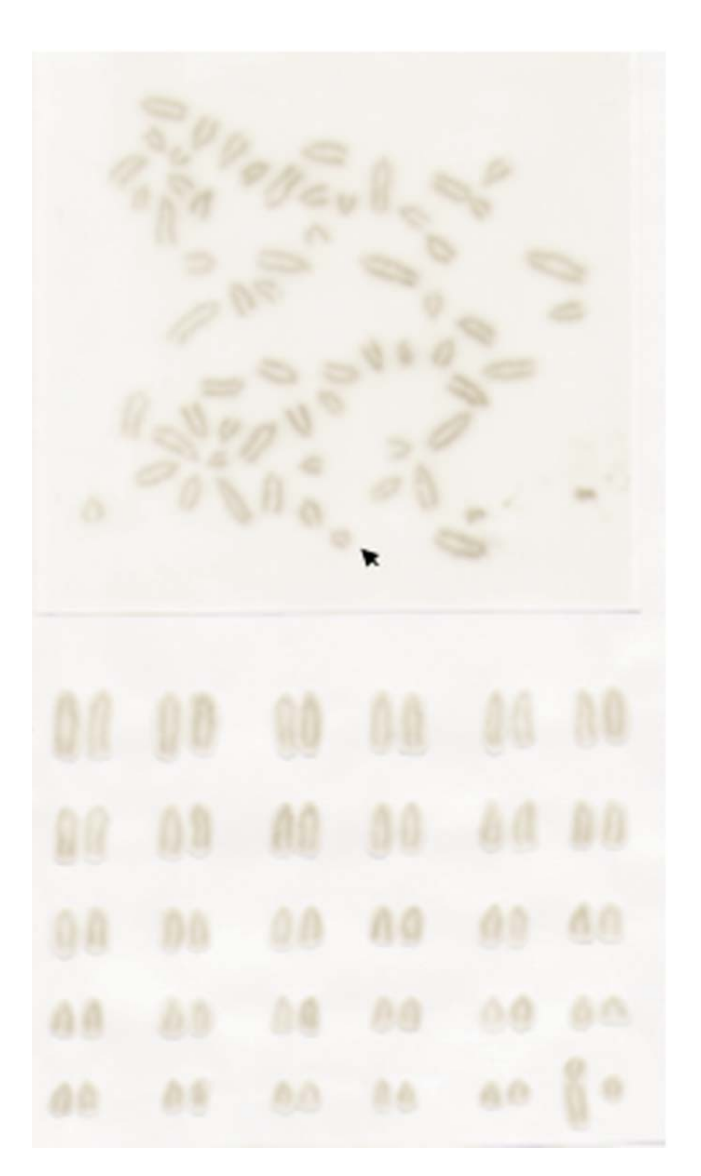
Figure 1. Karyotype of Pantaneiro cattle exhibiting an acrocentric Y chromosome, typical of Bos taurus indicus . Chromosome constitution 2 n = 60, XY.

In view of the contribution of males from both subspecies to the formation of this breed, it should be considered heteromorphic, because of the presence of the two types of Y chromosomes.