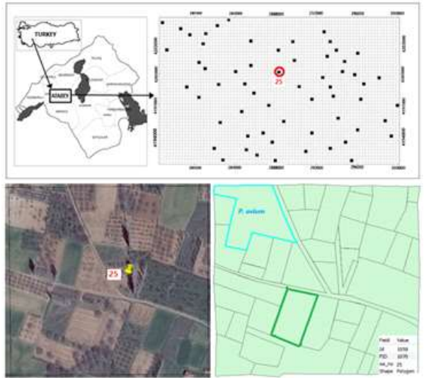
Figure 1 - Location of the plots in study area, plots/cell ID and land use/cover type.

The research area was divided into 2,741 squares of 300 m x 300 m (9 ha). Inventory work was carried