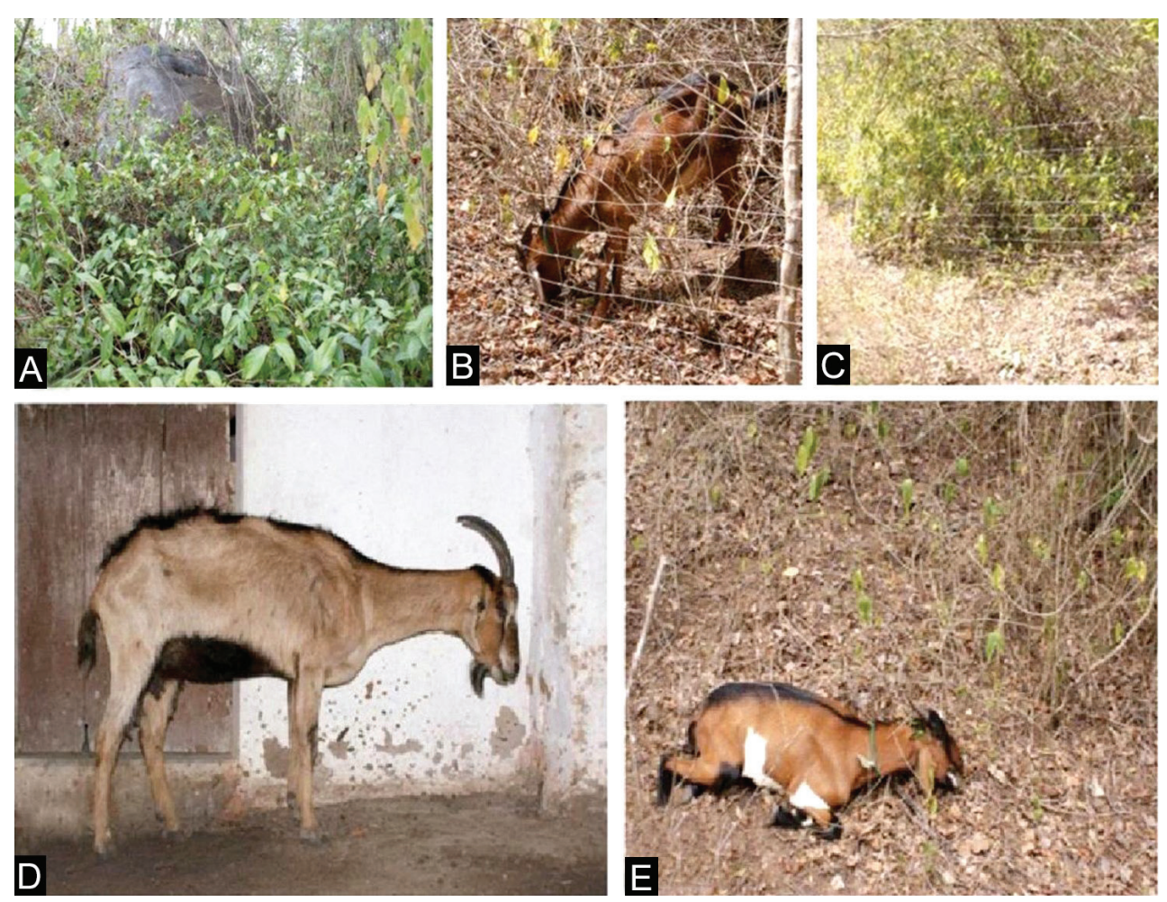
Fig.1. (A) Area with large amount of Amorimia septentrionalis in the location where the experiment was carried out (Limoeiro/PE). (B) Caprine spontaneously ingesting the leaves of A. septentrionalis 16 days after the start of the experiment. (C) Predominance of A. septentrionalis in comparison with other plants. (D) Caprine from Group 3 presenting extended neck and engorged jugular after natural ingestion of A. septentrionalis . (E) Caprine from Group 2 showing clinical signs of intoxication, which evolved to death 57 days after the natural ingestion of A. septentrionalis .

From the 16th to the 22nd day of the experiment, it was observed that goats from all groups began to ingest more