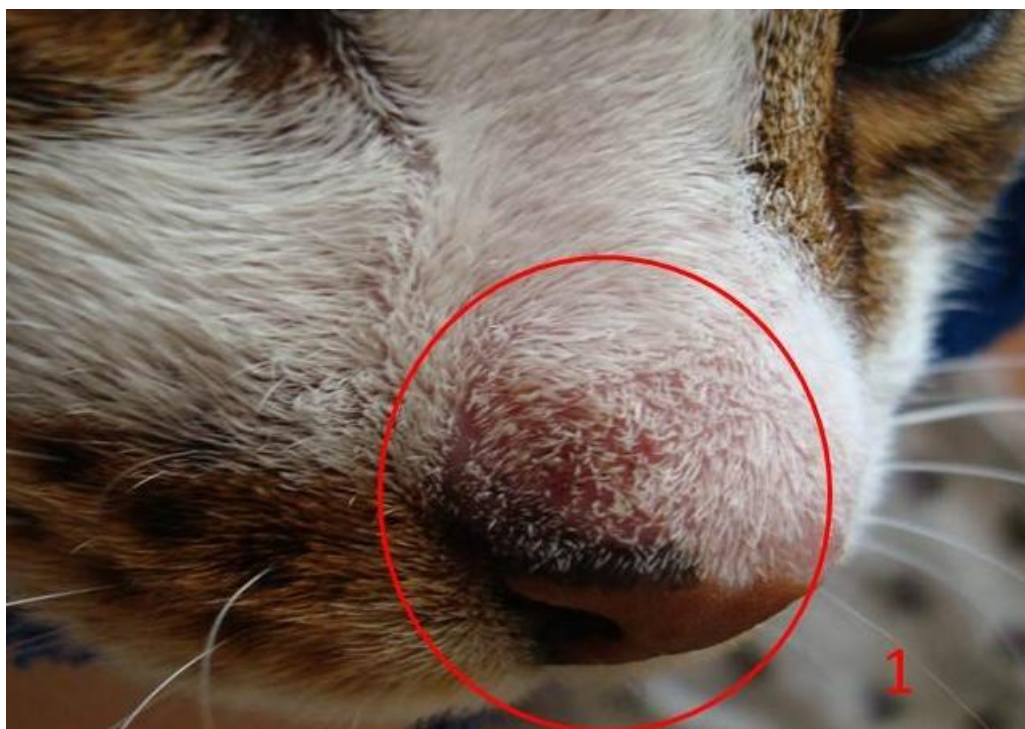
Figure 1. A 9-year-old male cat without definite breed, semi-domiciled, showing local reaction indicative of an active inflammatory process during treatment with Imiquimod 5% cream.