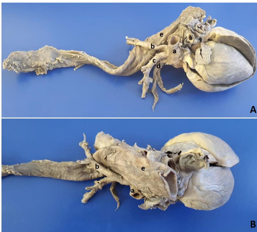
Figure 2. A 9-year-old female Dalmatian with a vascular anomaly. A) Aberrant right subclavian artery originating straight from the aortic arch (a) traversing over the esophagus (e). B) Aberrant right subclavian artery (a) and dilation of the caudal esophageal segment (e) confirming megaesophagus. (a) aortic arch; (b) right subclavian artery; (c) left subclavian artery; (d) brachiocephalic trunk; and (e) esophagus.