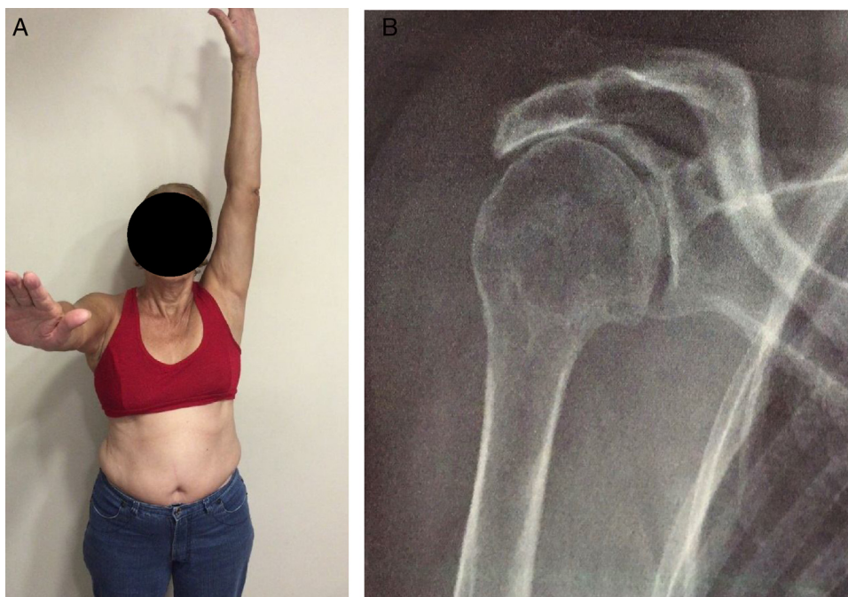
Fig. 1 – (A) A patient with rotator cuff arthropathy and pseudoparalysis of the right upper limb; (B) X-ray demonstrating rotator cuff arthropathy, classified as Hamada II.